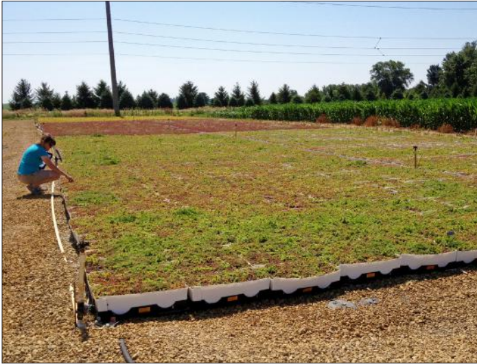
Sedum are custom grown in trays in an Iowa nursery.

There are two primary delivery and installation methods: in-situ and modular systems. In-situ or “built” up systems are constructed through a series of layers that are built-up on the roof deck using materials that arrive on-site in bulk. After placement of the components and soil media, the roof is vegetated by planting plugs, cuttings, or pre-grown mats. Modular systems or “trays” are mass produced in a nursery and individually placed on a rooftop in small 2’x4’ plastic units filled with growing media. Pre-grown plants are then set on top of the waterproofing membrane and root barrier.