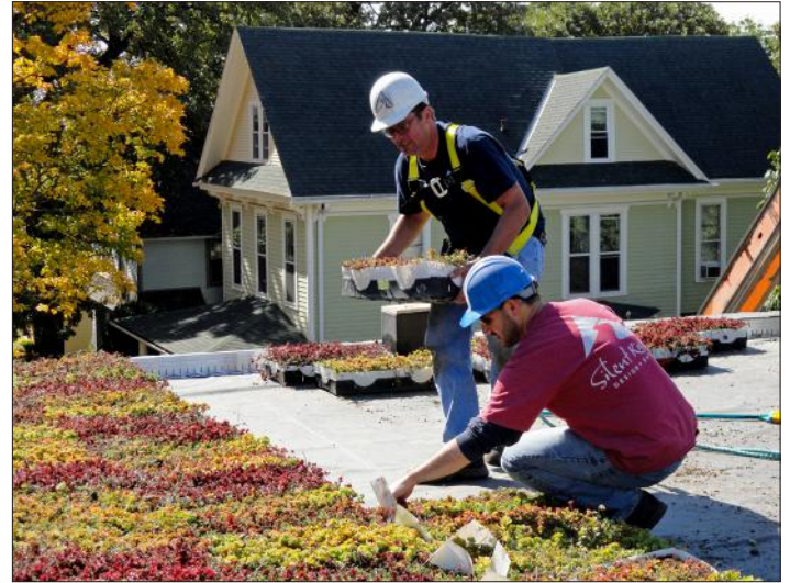
Sedum tray system is installed in Des Moines.