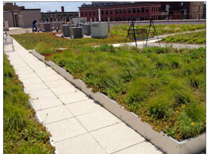
Quad Cities semi intensive rooftop has soil depths ranging from 4-8 inches.