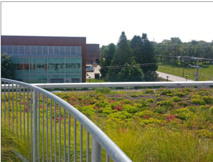
Semi intensive green roof at Central College in Pella supports more plant diversity.