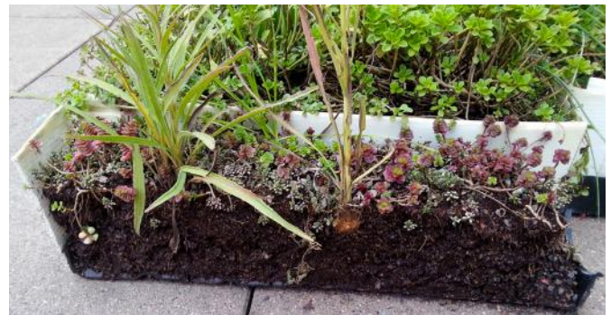
Cross section of an extensive green roof tray.