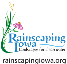
6 Cedar Rapids - Public Library